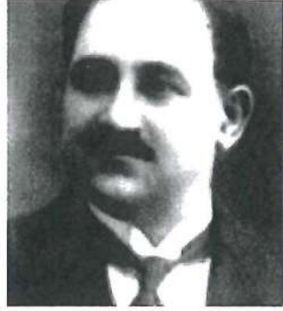
Mehmed Emin Resulzade (1884-1955)

After World War II Paris remained a very important centre for emigres from the Caucasus.