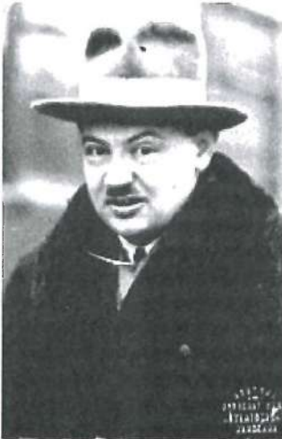
Tadeusz Hołowko (1889-1931)

The Caucasus Confederates Committee (CCC) was created in Istanbul in October 1924 with financial support from Poland (in the frames of the promethean movement) and was joined by representatives of the political organisations of Georgia, Azerbaijan and the North Caucasus. At the same time, in Paris in October and November 1924 representatives from the Caucasus decided to create a union of the three Caucasus republics in the form of the Caucasus Confederation.