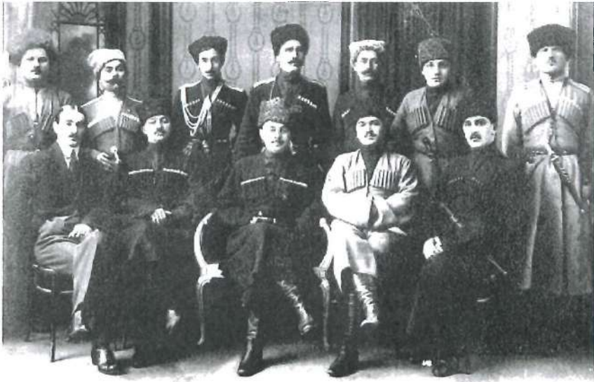
Leaders of the Mountainous Republic of the Northern Caucasus, France, 1920