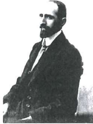
Noe Ramishvili (1881-1930)